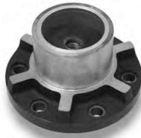
KSG0010 Center Mount Hub Aluminum (First Gen Gear Only)

CONVERT YOUR FIRST GENERATION KSE STEERING GEARS TO A CENTER MOUNT... PERFECT FOR MAKING AN INTERCHANGEABLE BACKUP UNIT!