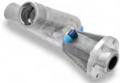
Live Tube Reservoir (First Gen Gear Only, Specify 14", 16", or 18" length when ordering)