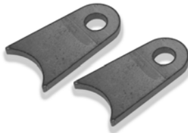
KSG1071 Weld-In Mounting Tabs for KSG1070

CONVERT YOUR FIRST GENERATION KSE STEERING GEARS TO A CENTER MOUNT... PERFECT FOR MAKING AN INTERCHANGEABLE BACKUP UNIT!