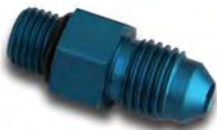
KSM6002 #3 ORB to #4 JIC High-Flow Wing Slider Fitting for Gen2 Gear