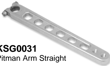
KSG0031 Pitman Arm Straight