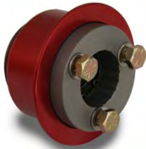
KSG1027 Pull-Type Quick Release Hub