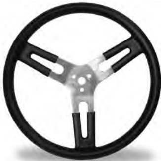
KSM1053 Steering Wheel 15" Flat