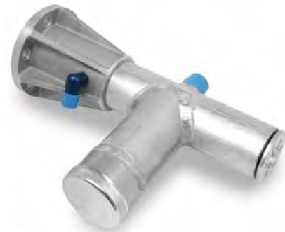
Dead Tube Reservoir (First Gen Gear Only, Specify 6.25", 7.25", or 8.75" length when ordering)