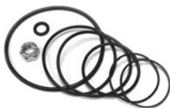
Steering Gear Seal Kit KSG0032 (First Gen Gear) KSG0035 (Gen2 Gear)