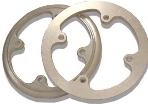
KSD1063 Pulley Guide - 44 Tooth Pulley