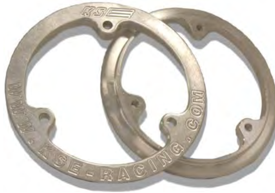
KSD1061 Pulley Guide - 40 Tooth Pulley