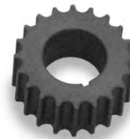
KSD1017 HTD 20 Tooth Pulley

See Page 31 for HTD Belt Drive Kit Assembly Details. Please call if there are any questions on your specific application.