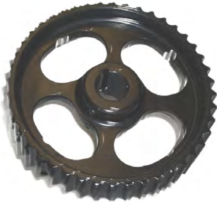
KSD1062 HTD 44 Tooth Pulley