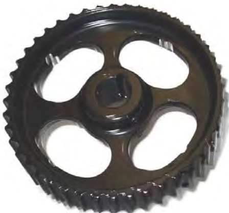
KSD1069 HTD 48 Tooth Pulley