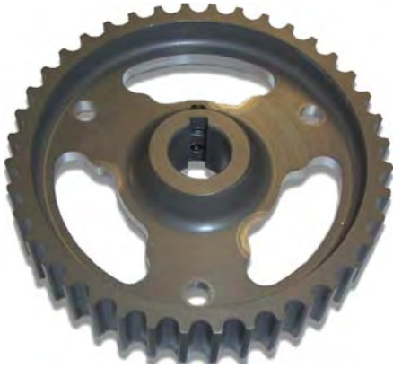
KSD1019 HTD 40 Tooth Pulley