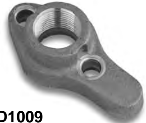
KSD1009 Hose Block Mounts