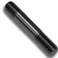
KSM1011-200 Water Pump Stud (4 required)