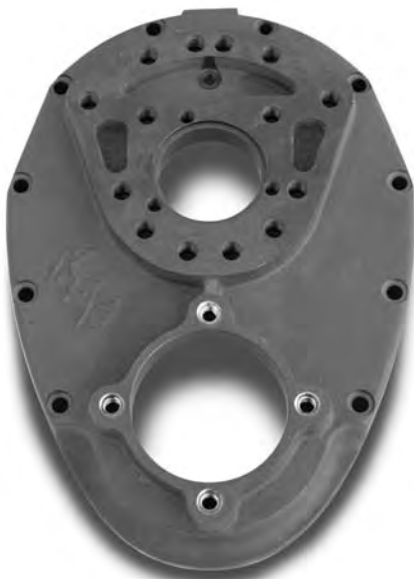
KSD1002M Front Cover, Magnesium Standard Cam Position