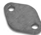
KSD1028 Water Pump Block-Off Short