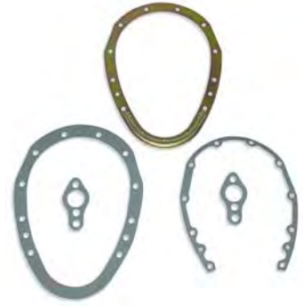
KSM1065 Pan Lip Seal Kit Pete Jackson and Chain Drive Cams