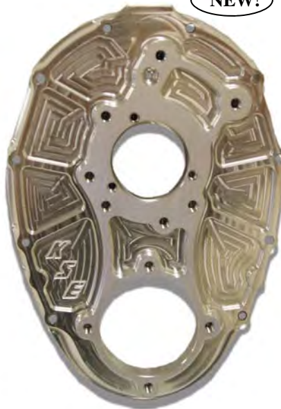
KSD1003 Front Cover, Billet Aluminum Standard Cam Position Top Timing Port