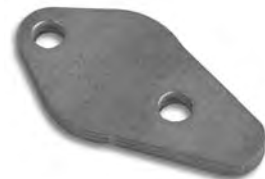
KSD1027 Water Pump Block-Off Long